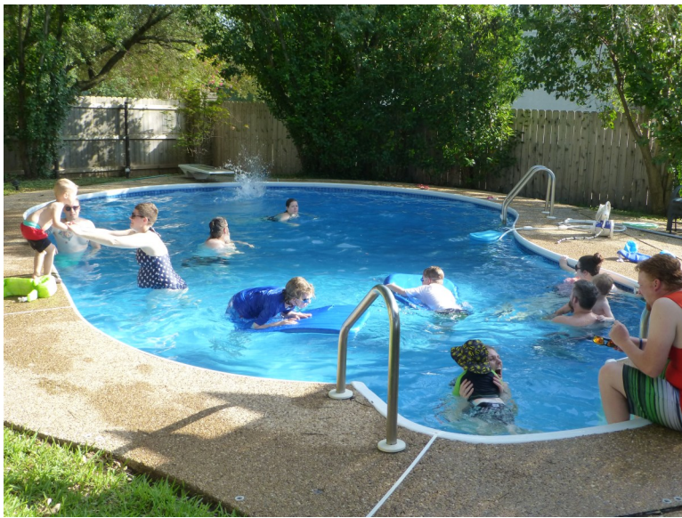
— swimming sabbath at the Sauters' pool

If you would like to contribute a digital photo to our "Summer Sabbath series" please send your picture to sharlande@lsbcwaco.org and krysta@lsbcwaco.org .