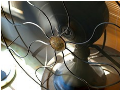
Fans for Waco

You can help make this summer a more bearable for those less fortunate. We're anticipating 100+ degree days this week. The heat is hard on everyone. If you'd like to bring a new or gently used fan, please drop it by the church during office hours. They will be equally distributed between Meals on Wheels and Caritas as a collaborative effort to support older adults. In some instances, your gift could be life-saving.