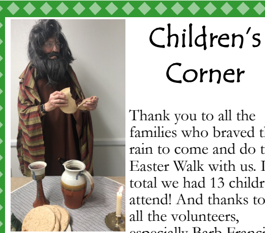
A special guest broke the bread. Guess who!