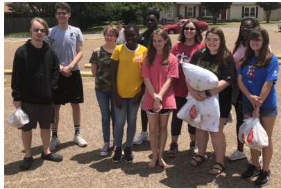
Picture: The youth as they departed for camp. Big thanks to everyone who made this a successful trip!

July and August Events -We have plans forming for something fun in each of the coming months. So, watch this space for more info.