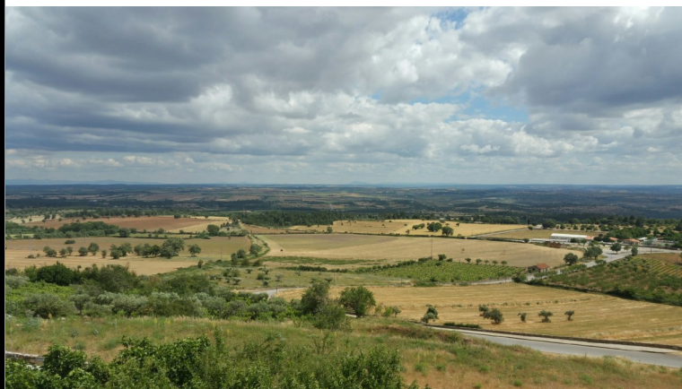
Siri River Valley, Portugal