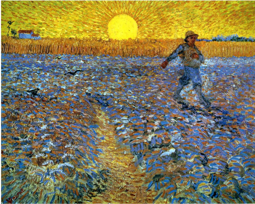
"The Sower" - Vincent van Gogh

"Tell us about the Kingdom of Heaven" they say. Jesus pauses for a moment, considering. What could he say? How could he possibly put it into words? For there is really no adequate way to talk about God. Try as we may, there will always be more to God than words can hold. The whole point, after all, is that God is to be encountered, discovered, experienced, not to be described.